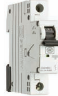
Fig 7: MCB