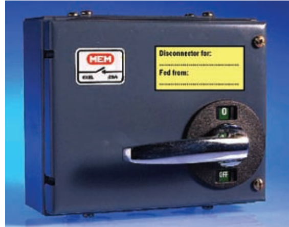
Fig 5: Identifiable means of isolation