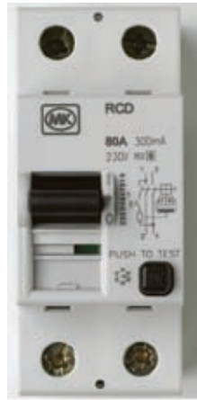
Fig 4: S-Type RCD

All such equipment shall be arranged well away from combustible