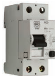
Fig 6: RCD