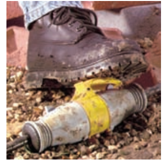
Fig 8: Plug and socket-outlet