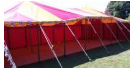
Below: 6 x 12m open fronted as venue for a brass band.(with extra raised front)

Tent volume 240 cubic m. Basic BTU needed 59000 btu's. i.e. 17kw heat ,(notwithstanding temperature co-efficient difference) i.e. use Arcotherm EC32, ( generating 32kw Heat) for most occasions.