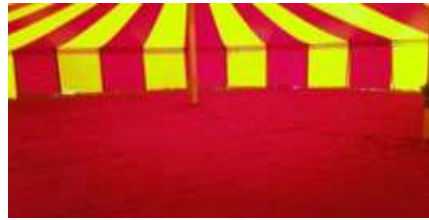
natural red coconut matting

coconut matting in natural brown colour available to Marquee Cord /Exhibition style thin carpet or washable Dandy Dura as below