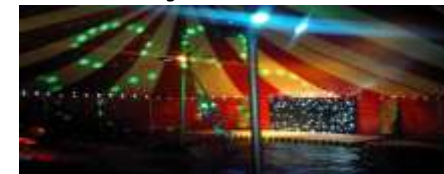
same view night time