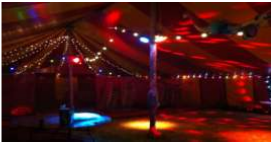
a typical set up.

This list is non exhaustive, is often added to, will be added to!