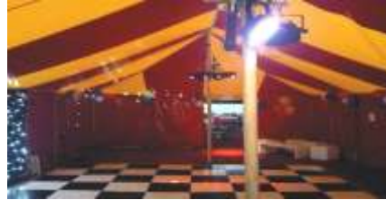
(walled with entrances at your discretion) Below; used as linked catering tent.