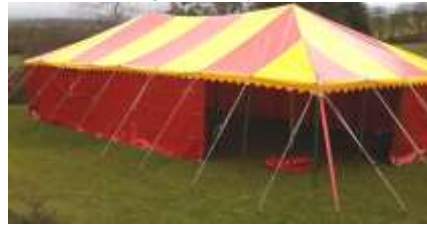
"Long & Shorty"