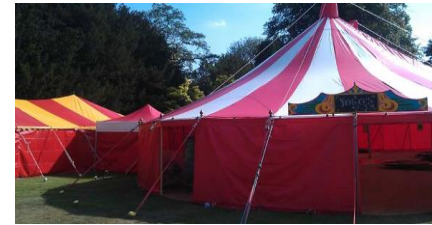
Below: 6 x 12m open fronted as venue for a brass band.(with extra raised front)

Tent volume 240 cubic m. Basic BTU needed 59000 btu's. i.e. 17kw heat ,(notwithstanding temperature co-efficient difference) i.e. use Arcotherm EC32, ( generating 32kw Heat) for most occasions.