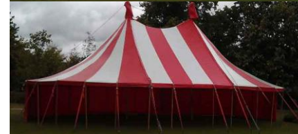
"Strawberries & Triple Cream"