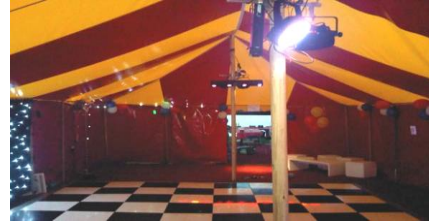
(walled with entrances at your discretion) Below; used as linked catering tent.