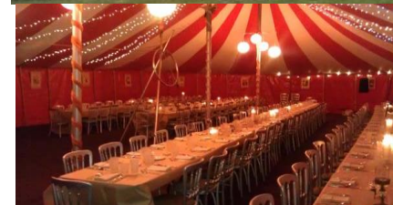
sample inside view daytime